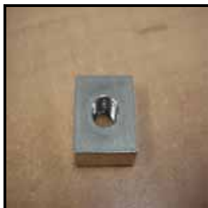
Plate Centering Clutch