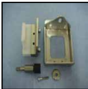
Catch V-Plate with Plate Holder