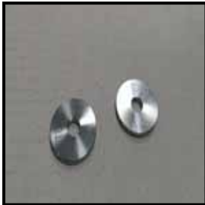
Spring Pawl RH