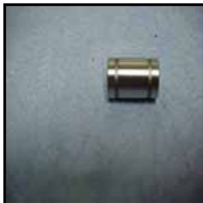
Machine Labeler Pad