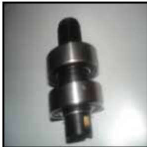
Cam Wheel with Bushing