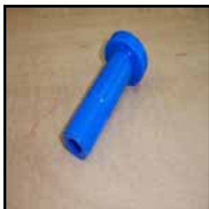
LH Drill Holder