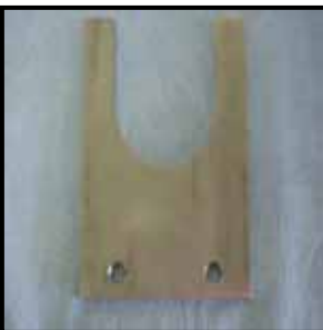
Center Heater (Brass)