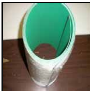
Belt with Metal Lacing