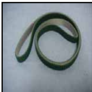
Carrier Belt 1465mmx24mm